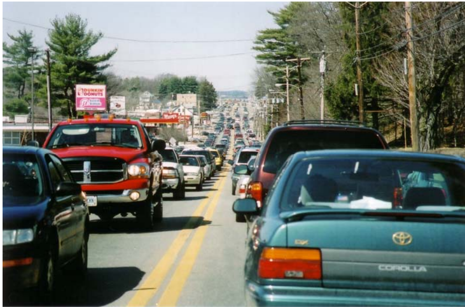
The Salem traffic-jam.

On the Van shot, I set the camera to “partial metering” which is a broader version of spot metering with the camera aimed at the side of the van (door open). Alan Jr. did this shot. As you can see the background is somewhat overexposed to accommodate some bracketing for the wide variation of lighting. 6 I’m somewhat satisfied with that test. Now it’s off to Salem.